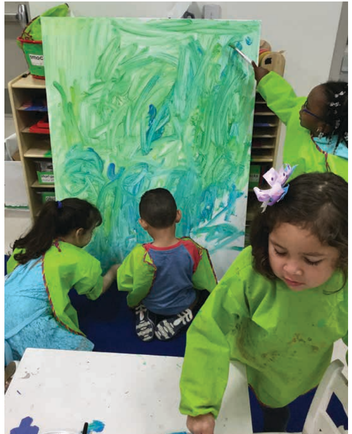
Teachers in this program emphasize sensory materials, as illustrated here, where the children are creating a large art mural with finger paint and brushes.