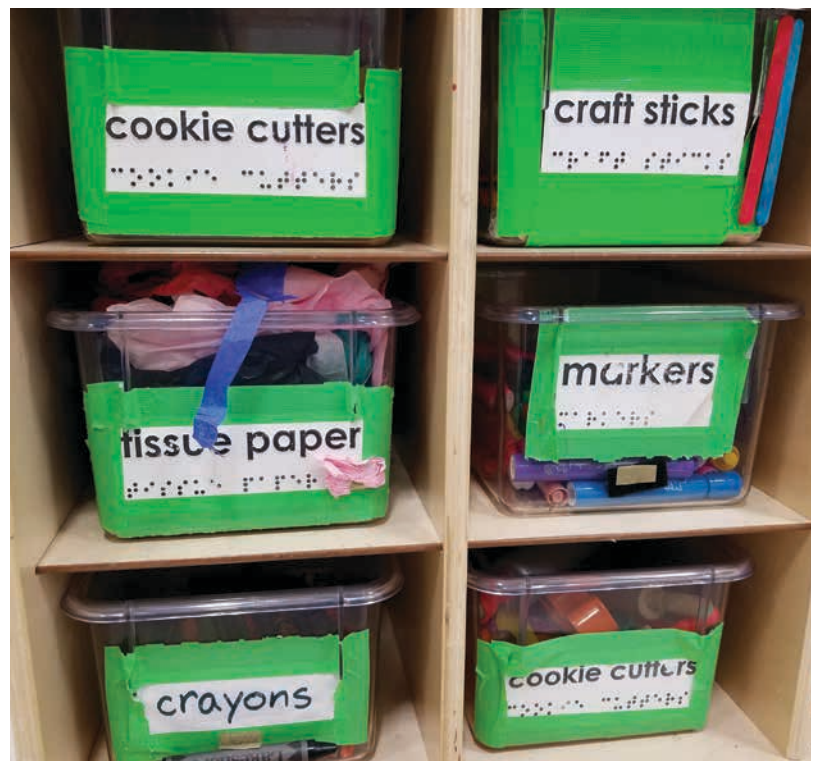
In addition to using real objects on labels for items, the labels in this classroom also include the name of the object: in words and in Braille.