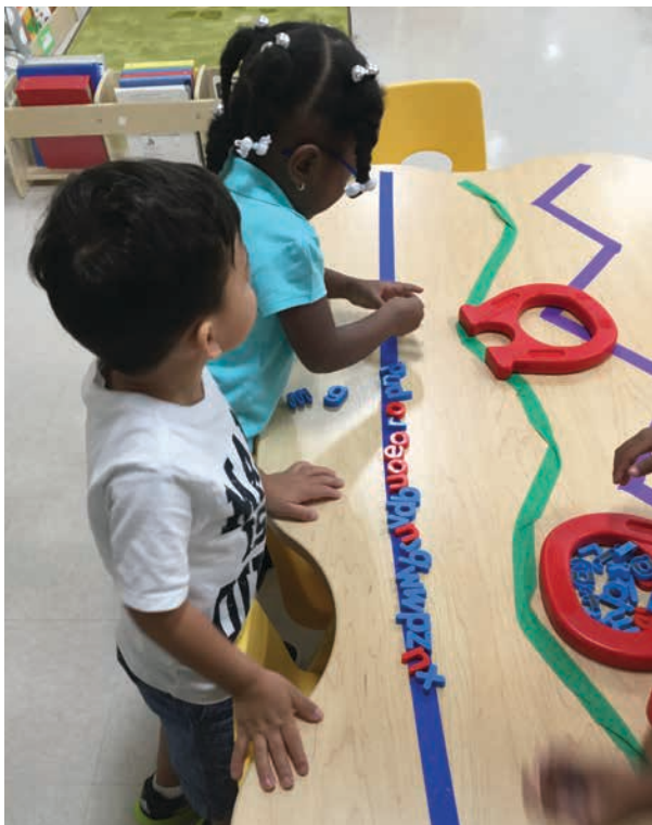
At Miami Lighthouse, visually impaired or blind children work alongside sighted children and learn that each person has different strengths and abilities.