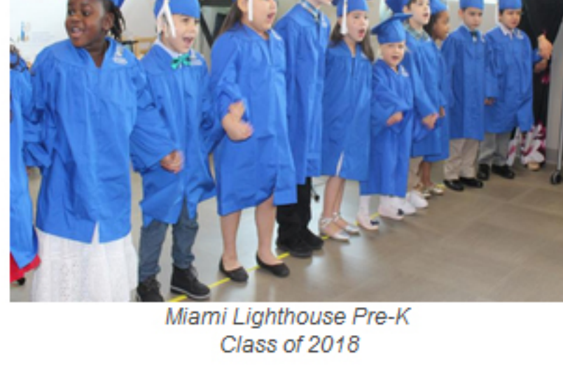
Miami Lighthouse Pre-K Class of 2018

The Miami Lighthouse Learning Center for Children™ graduated its first Pre-K class in its new building and shared the spotlight with their Dads at a special Father's Day celebration.