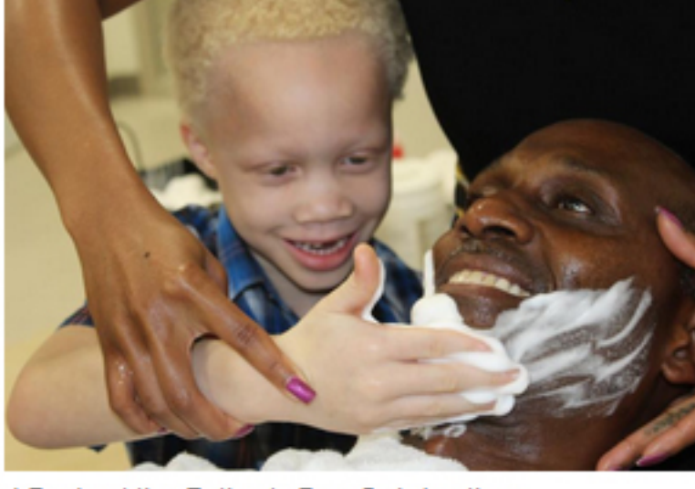
Miami Lighthouse Pre-K graduates and Dads at the Father's Day Celebration