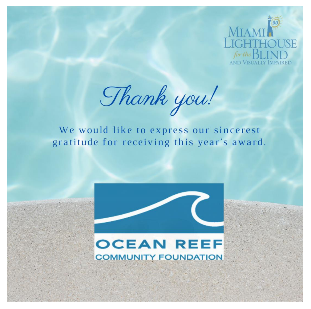
Thank you Ocean Reef Community Foundation

We would like to express our sincerest gratitude to the Ocean Reef Community Foundation for their generous $10,000 grant to our Statewide Florida Heiken Children's Vision Program. The award will help us support comprehensive eye examinations for low-income children in Homestead, Florida City and the Keys. During this difficult time, our staff are working remotely to continue processing incoming referrals for vision services and issuing vouchers to eligible children.