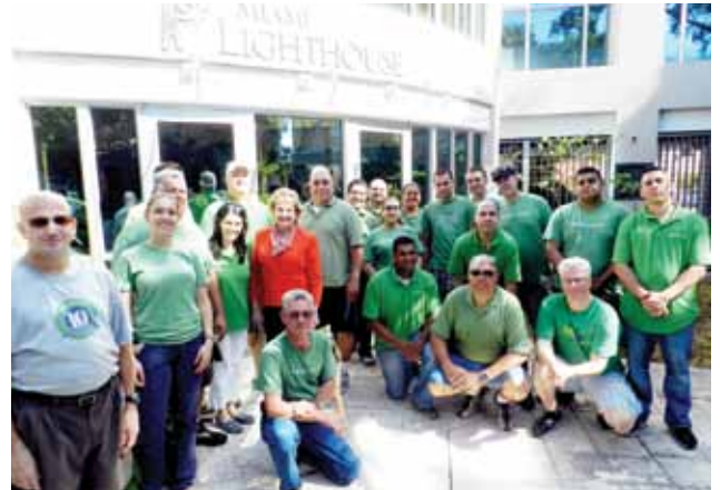
“Publix Serves Day” Team