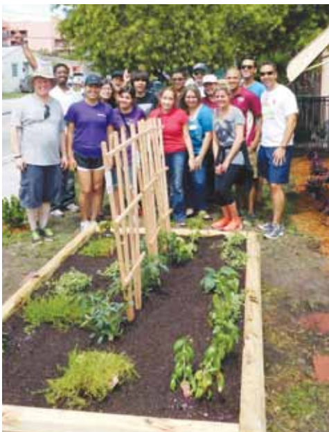
Thanks to BB&T Bank and SFM Services, Miami Lighthouse high school students are enjoying a community garden designed to appeal to the five senses, offering fragrance, a variety of natural textures, the sounds of birds and bees and the taste of fresh grown herbs and vegetables.

On February 7, 2015, Miami Lighthouse in collaboration with the Florida International University Nichole Wertheim College of Nursing and Health Sciences Occupational Therapy Department offered our fourth continuing education seminar for Occupational Therapists, Physical Therapists and Nurses to empower healthcare professionals with the knowledge they require to meet the needs of the growing number of patients who are impacted by low vision. The all-day seminar was attended by 44 registrants who received continuing education credits for their participation. Topics related to low vision and blindness as they impact functioning and quality of life from birth through the adult years included infant development, assistive technology, communication, patient/family centered care and independent living. On the evaluation questionnaire participants' overall rating of the workshop was 4.9 out of 5. This annual seminar is made possible in part by a grant from The James Deering Charitable Trust.