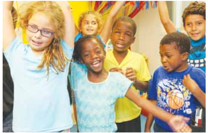
If you're happy and you know it clap your hands!