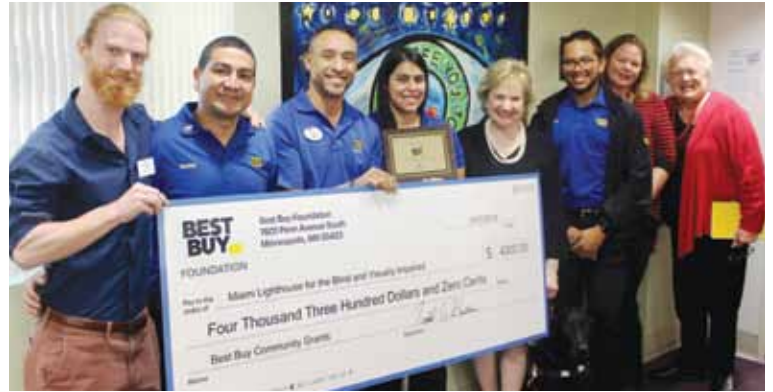
Best Buy check presentation to Miami Lighthouse's Music Program

Our unique Music Program, an inclusion program with both sighted and visually impaired students, has again been awarded a significant grant by Best Buy. The majority of our Music Program students reside in under-served, low-income communities countywide. Research suggests that the inclusionary design of our program fosters understanding and appreciation for individual differences among students and minimizes the adverse effects of segregation based on disabilities.