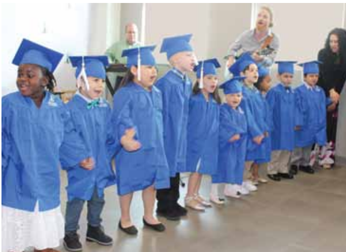
Lighthouse Learning Center for Children™ 2018 Pre-Kindergarten graduation

We express our thanks to The Art of Shaving for enabling the children and their parents to have this delightful experience.