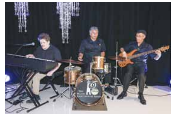
Miami Lighthouse musicians performing at Music Under the Stars