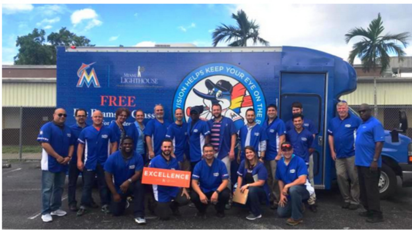
Miami Marlins Ayudan Team "Excellence" outside Major League Baseball and Miami Marlins branded Heiken mobile unit at Citrus Grove Middle School.

A special thanks to the Miami Marlins and Walgreens on Give Miami Day. The Miami Marlins Ayudan Team "Excellence" volunteered with our Heiken Children's Vision Program optometrists at Citrus Grove Middle School conducting 442 vision screenings and 99 dilated eye exams. Seventy low-income Citrus Grove Middle School students received a pair of prescription glasses.